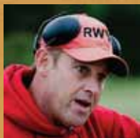
Instructor demonstration, Waterman, IL

Appleseed instructors are some of the most qualified in the country. All instructors receive over 125 hours of training and are continuously tested before running an Appleseed event. Attendees can be assured of the highest level of safety and a rich learning experience.