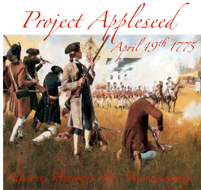
"Stand Your Ground"

The enemy of Appleseed and all Americans is apathy and ignorance. To keep a Republic the public must be involved, so take up your civic duty and get involved. Turn off the television, get off