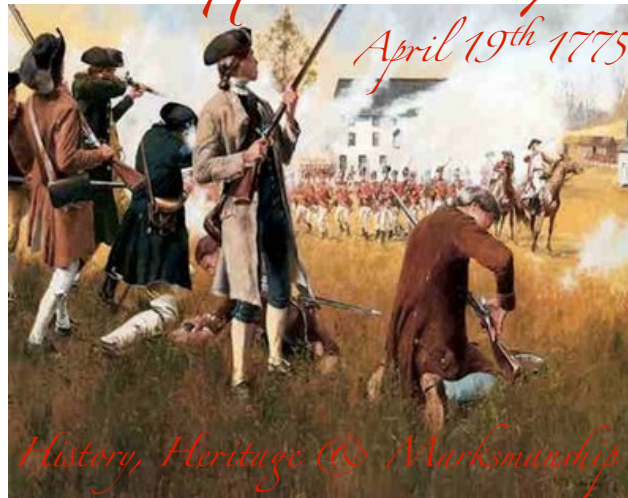
"Stand Your Ground" by: Don Troiani

FIND OUT MORE ONLINE: WWW.APPLESEEDINFO.ORG