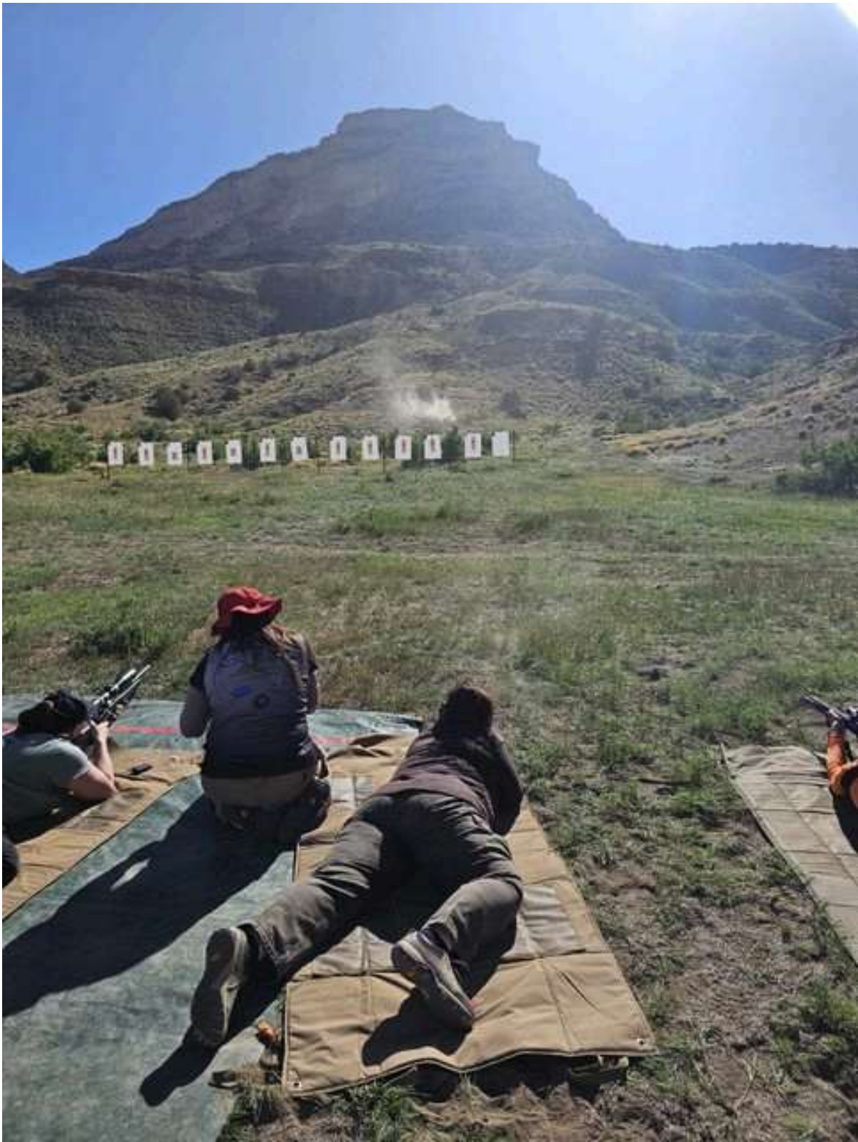
Project Appleseed at NRA Annual Meeting