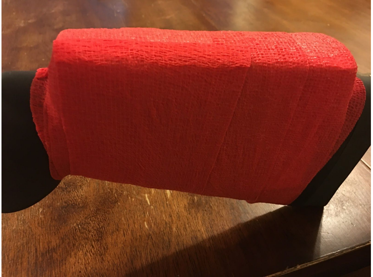
Wrapped good and tight.