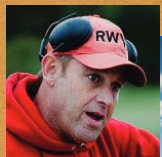
Instructor demonstration, Waterman, IL.

Appleseed instructors are some of the most qualified in the country. All instructors receive over 125 hours of training and are continuously tested before running an Appleseed event. Attendees can be assured of the highest level of safety and a rich learning experience.