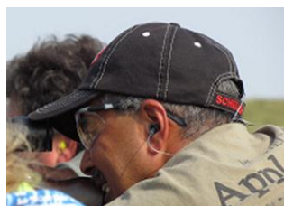
xl target in Wells Sept 15 th , 2012

"Pick up a rifle and you change instantly from a subject to a citizen"