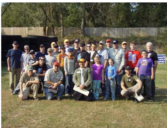
Rochester Appleseed September 2012