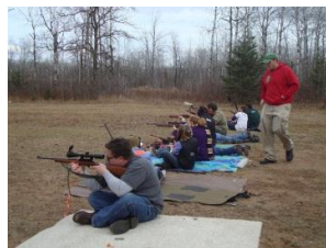
AFTERMATH has the line