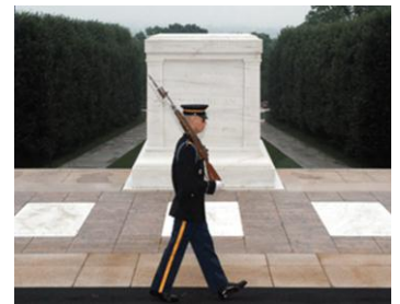
Standing guard at the Tomb of the Unknown Soldier